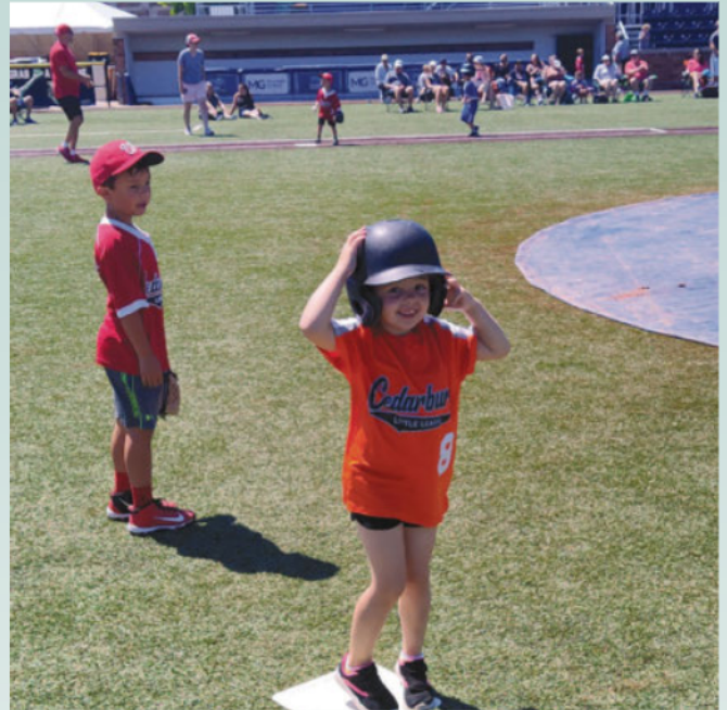
(2022 T-Ball Finale at Kapco Field.)

Registration for this program begins in January and concludes at the end of February. For more information please visit www.cedarburglittleleague.com .