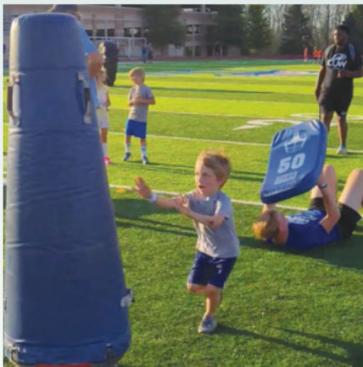
(2022 Concordia Clinic)