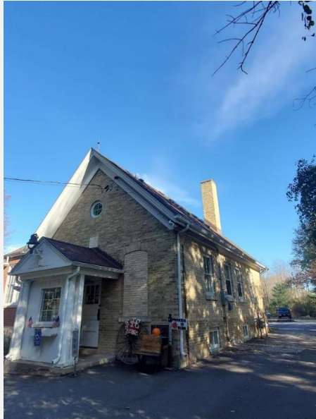
Ye Olde Schoolhouse above